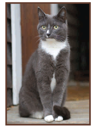
Having your pet spayed or neutered is a part of responsible pet ownership.

Yes! This is a one-time expense that can dramatically improve your pet's quality of life and prevent some frustrations for you. If you are still uncertain whether or not to proceed with the surgery, consider the expense to society of collecting and caring for all the unwanted, abused, or abandoned animals being housed in shelters.